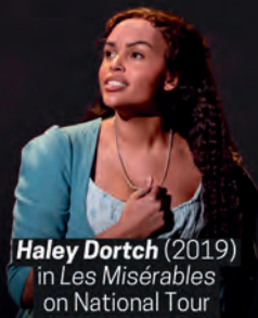
Haley Dortch (2019) in Les Misérables on National Tour