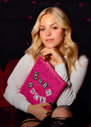
Andrew Barth Feldman & Renee Rapp