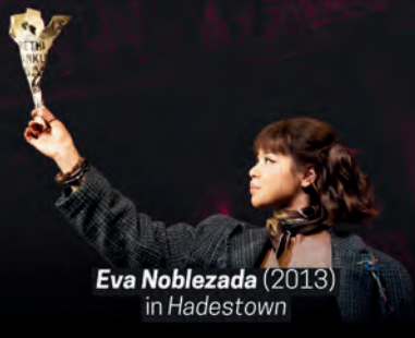
Eva Noblezada (2013) in Hadestown