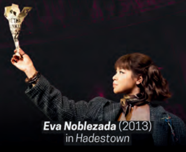
Eva Noblezada (2013) in Hadestown