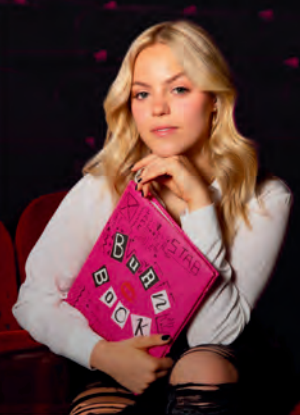
Andrew Barth Feldman & Renee Rapp